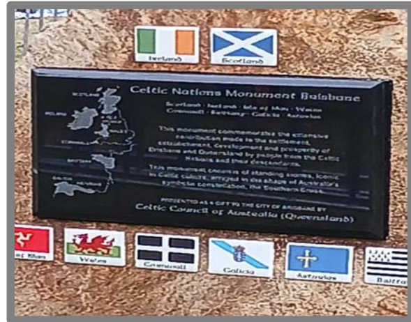
The Celtic Nations Monument Plaque