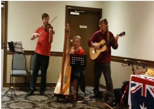
Three members of Phillip's Dog playing Manx Music